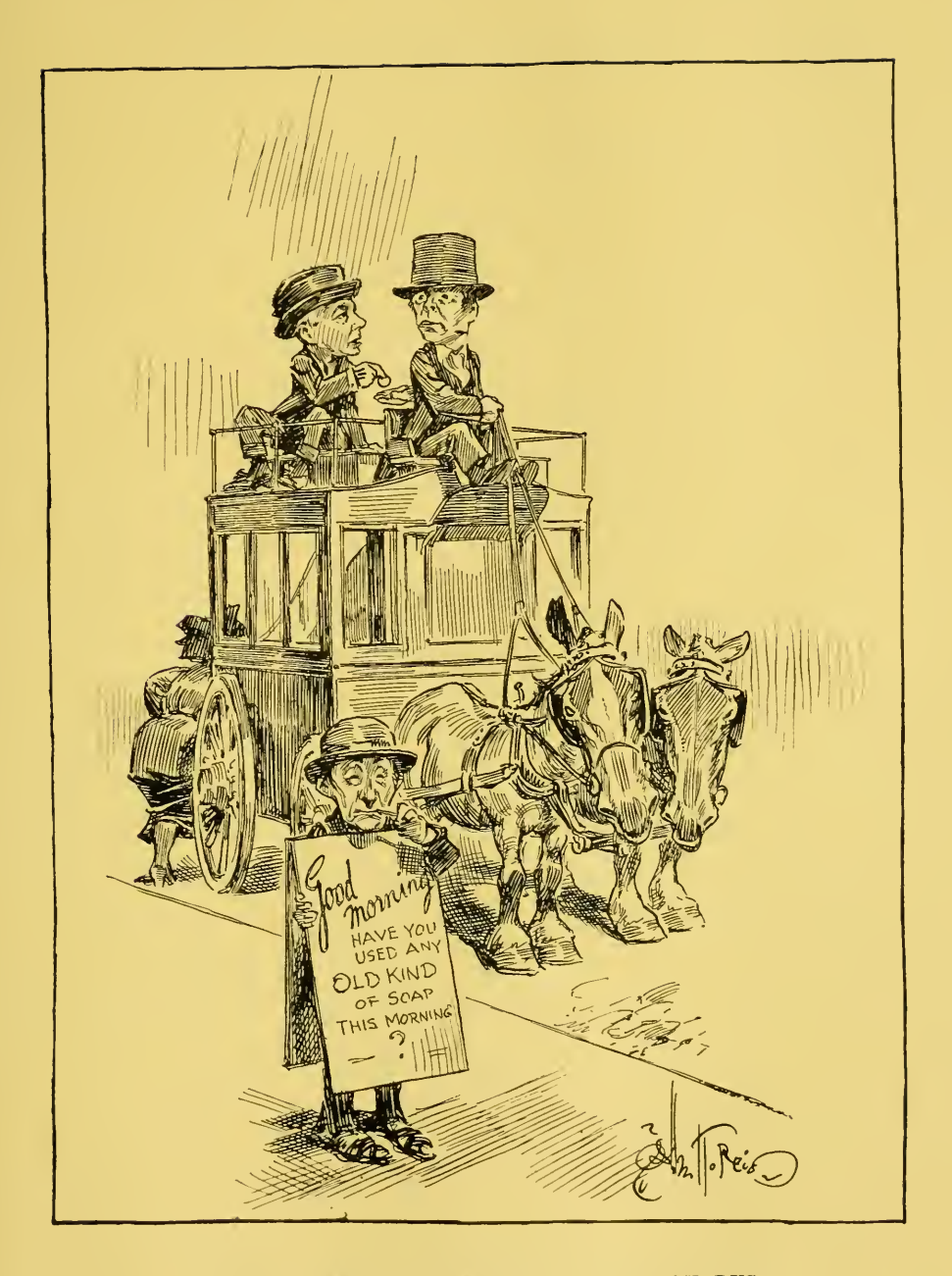
SEEING LONDON FROM THE OLD ENGLISH BUS